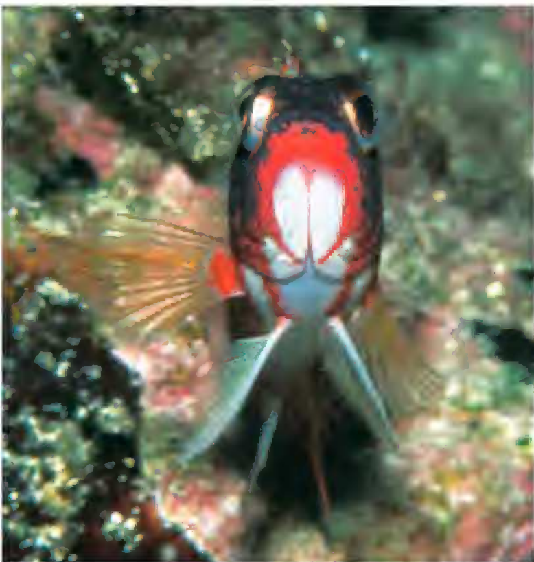
FIGURE 8. Throat color of Serranus pulcher , near Santana Islet, São Tomé.